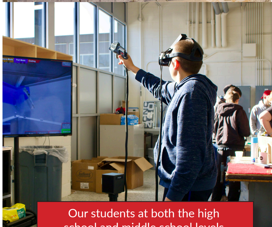
Our students at both the high school and middle school levels were able to visit the Trades Fair at Whitnall High School. They were able to experience a variety of trades and learn how to start preparing for their futures.