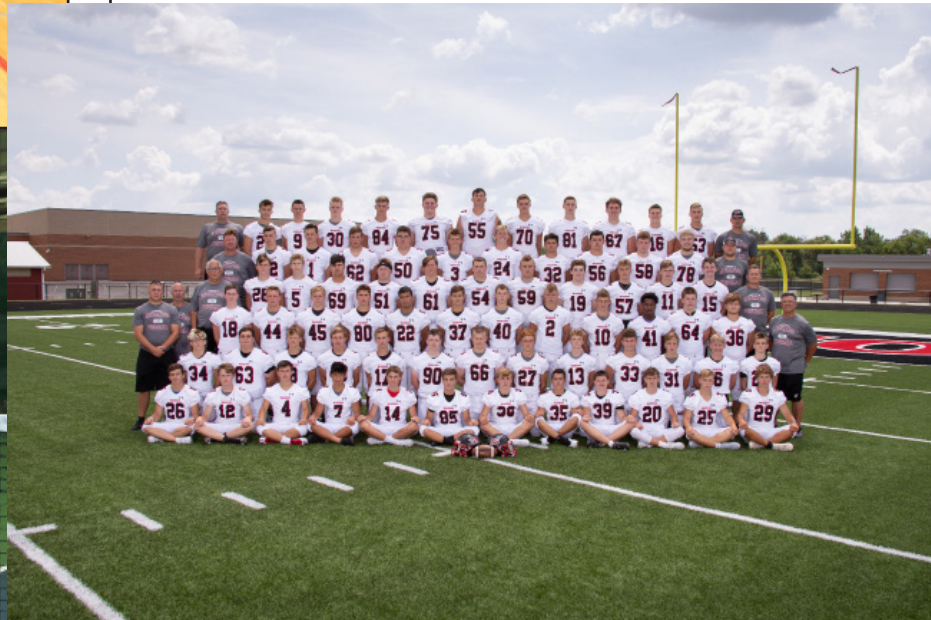
The Boys Football team took home another state championship this year against Bayport.