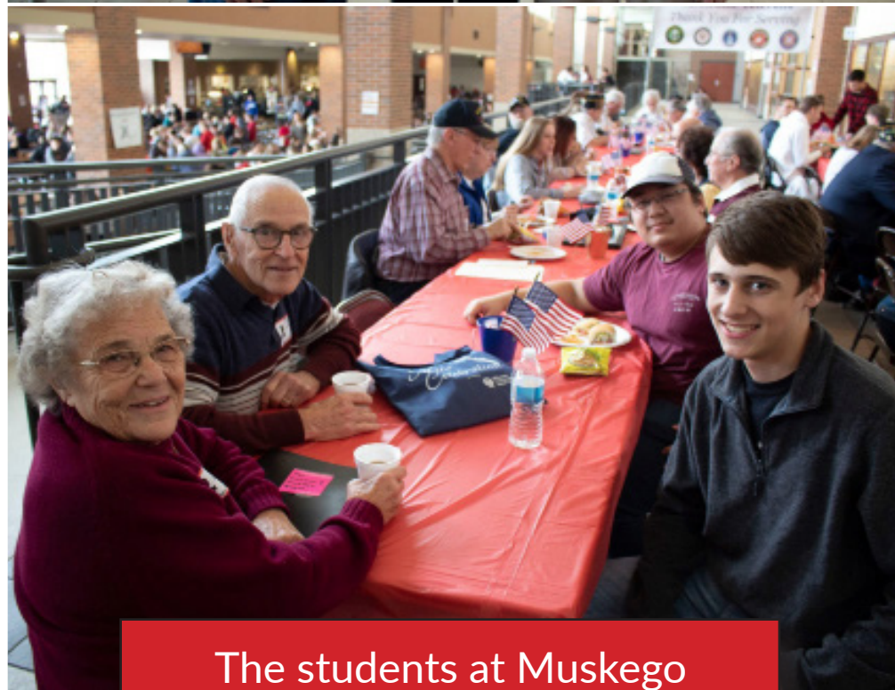
The students at Muskego High School hosted a lunch for local veterans on Veterans day.