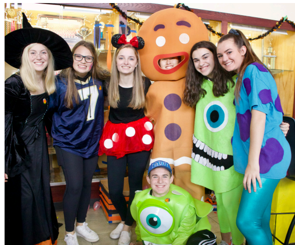
The Student Council hosted their annual Spooktacular event for the entire community. This year was a record attendance with over 500 families attending.