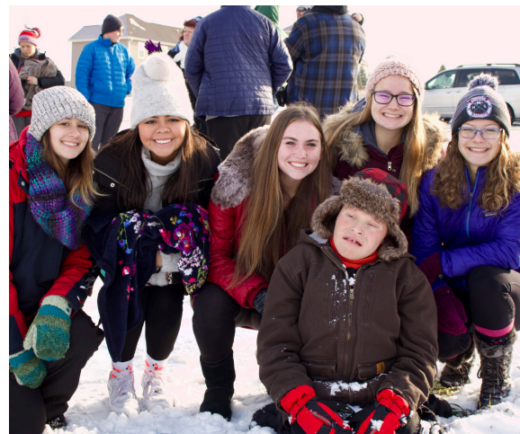
The Best Buddies program hosted a fun event at The Elegant Farmer where over 130 people attended for hay rides, corn mazes, and craft food.