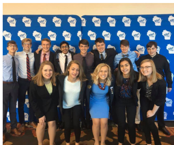
The Future Business of America enjoyed their time in Madison for the Wisconsin Fall Leadership Conference.